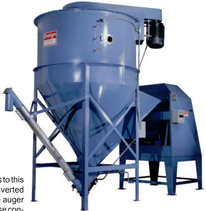
72" Dia. Mixer with Dumper Infeed and Auger Discharge

Our extended legs option would allow you to place the mixer high enough to gravity discharge into gaylords. The optional auger discharge would deliver your mixed material to a machine or storage vessel or Vacuum Discharge would enable you to deliver your mixed material directly into your vacuum system.