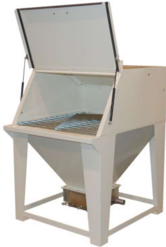
Bag Break Station Dimensions